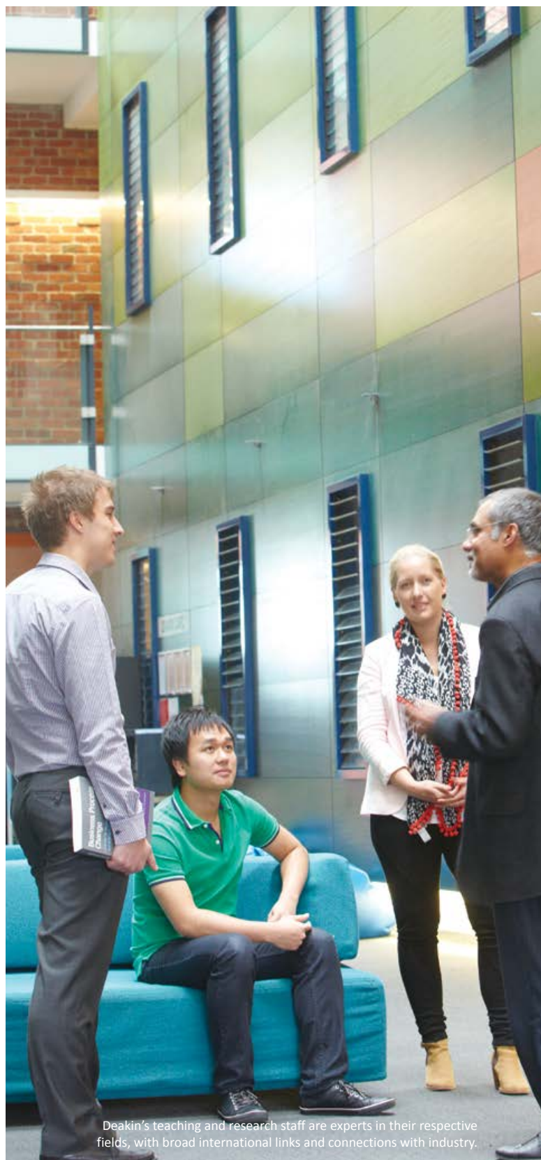
Deakin's teaching and research staff are experts in their respective fields, with broad international links and connections with industry.

# MPT code denotes study tour version of the unit. The cost is in addition to the tuition fees.