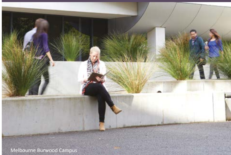
Melbourne Burwood Campus

For more information, please visit deakin.edu.au/current-students/it-support/computer-standards .