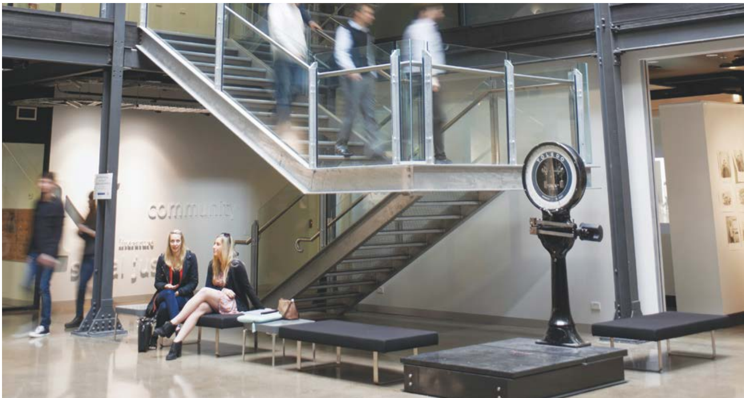
Geelong Waterfront Campus

Information and business analytics at Deakin spans the full spectrum of the value chain of information, from the harnessing and storage of information to the analysis of that information and evidence-based decision-making that adds value to organisations and society. Our research and teaching programs explore and examine the role and use of information in developing creative and innovative approaches for organisations to improve their strategic and operational performance, as well as how society can better use information networks and technologies to enhance the quality of life and community aspirations.