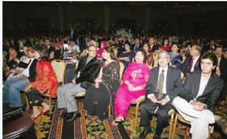
Audience enjoying the entertainment program.