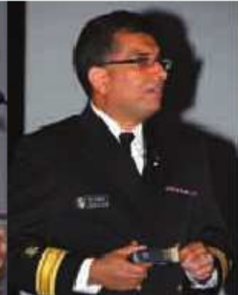
Rear Admiral (USN) Ali S. Khan - New Approach to Emerging Infections