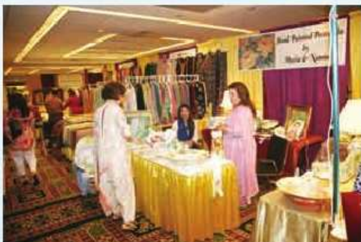
APPNA bazaar at the San Francisco meeting.