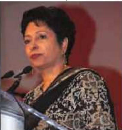
Dr. Maleeha Lodhi former Pakistani Ambassador addresses the annual summer banquet attendees.