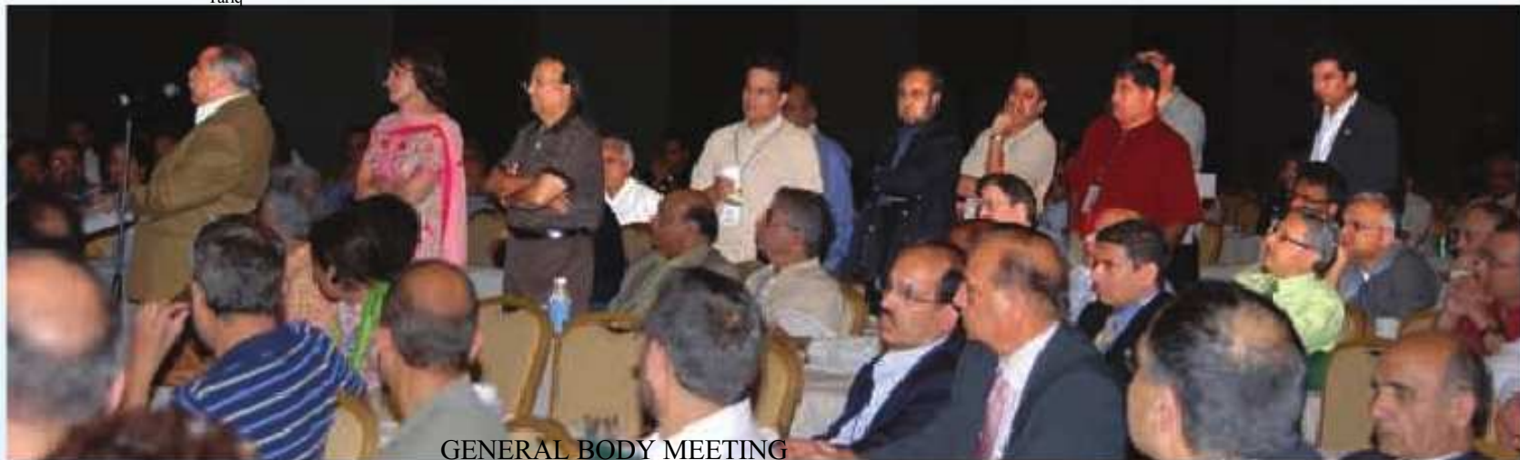
GENERAL BODY MEETING