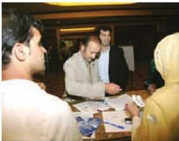
Tipu helping members at the reception.