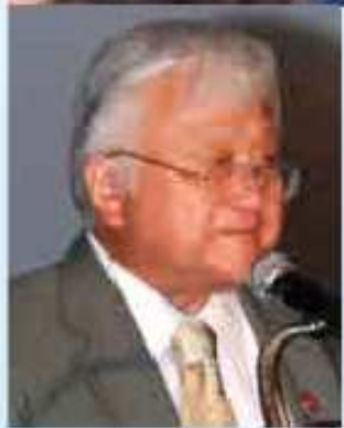
US Rep. Mike Honda (D-CA)