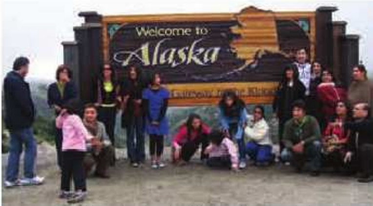
Tour group assembles at the edge of a cliff where they rest and photo-shoot.