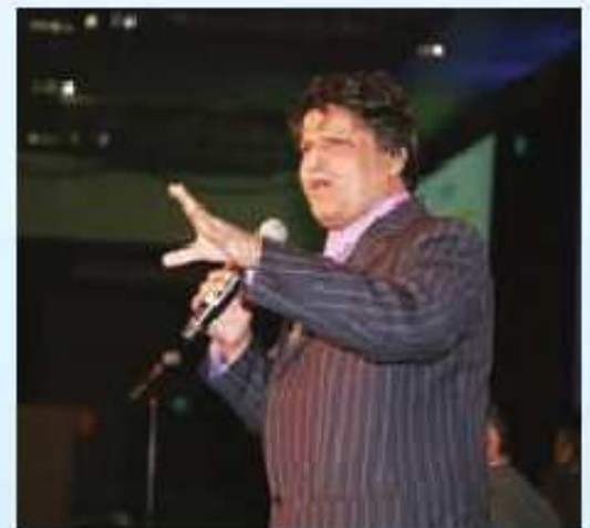
Omar Sharif performing at the entertainment program.