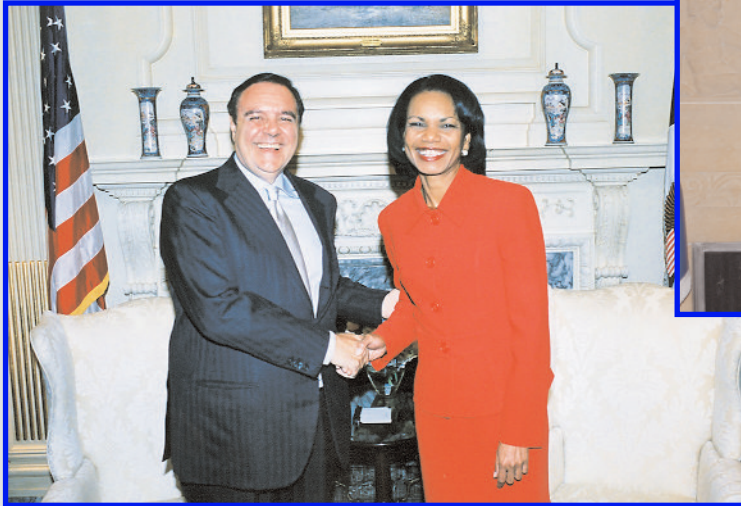
The Italian Minister of Justice and Secretary of State Condoleezza Rice