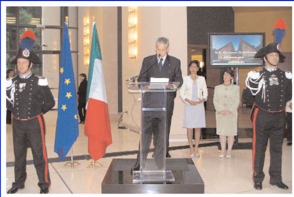
The Ambassador's Speech during the Italian National Day, June 2, 2006.