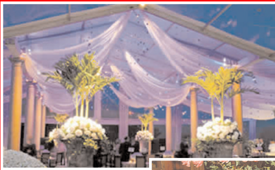
An outdoor view of Firenze House on the evening of the event