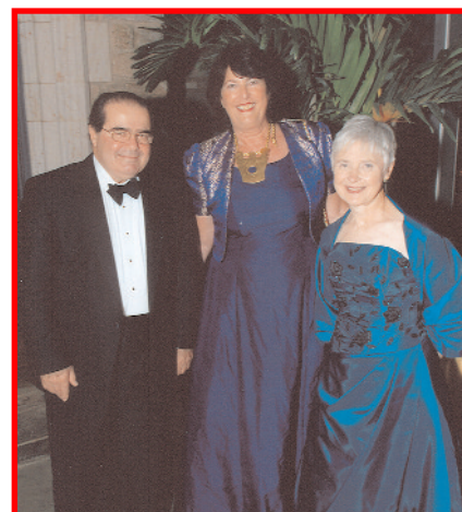
Justice Scalia and his wife Maureen