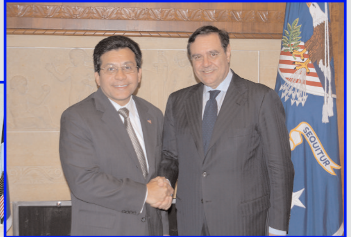
Secretary of Justice Alberto R. Gonzales and Clemente Mastella, the Italian Minister of Justice.