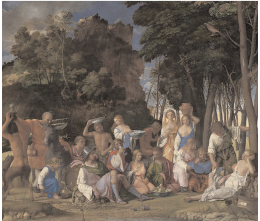
The Feast of the Gods, Bellini-Tiziano, oil on canvas 1514, 1529

"This exhibition brings the Renaissance alive not only as an era in history, but also as a concept embraced by the most adventurous artists of their time," said Earl A. Powell III, director of the National Gallery of Art.