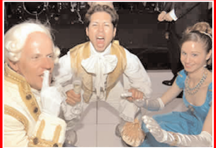
A not so serious opera moment