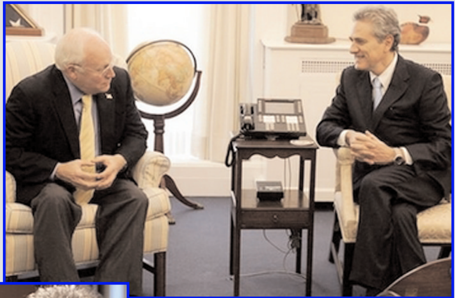
Vice President Dick Cheney and Fancesco Rutelli during their cmeeting at the White House.