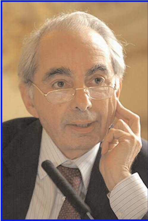
The Minister of the Interior of Italy, Giuliano Amato

M inister Amato held talks in Washington with Homeland Security Secretary, Michael Chertoff, with Attorney General, Alberto Gonzales, and with the Director of National Intelligence, Ambassador John Negroponte.