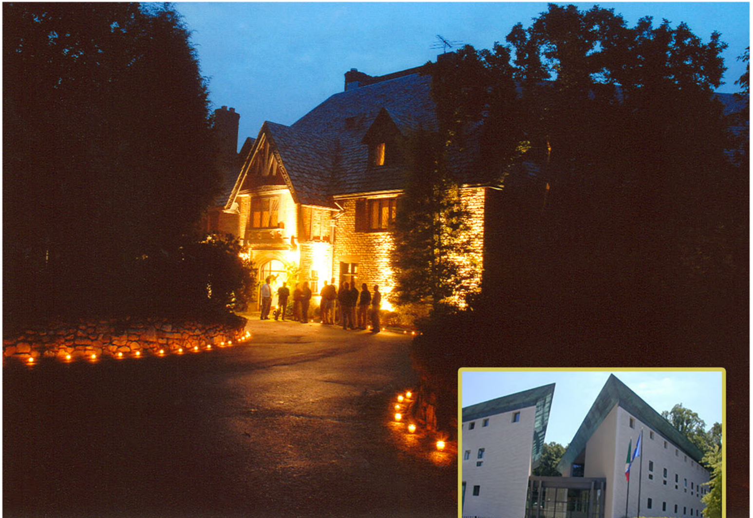
An Outdoor View of Villa Firenze on the Evening of the Opera Ball.