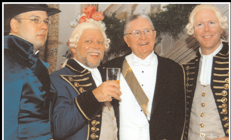
A toast to the opera ball