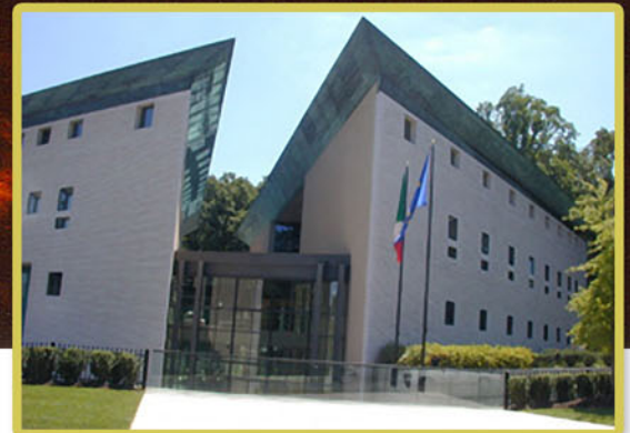
The Embassy of Italy in Washington DC