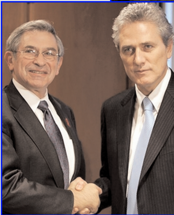
President of World Bank, Paul Wolfowitz met at the World Bank to discuss development and cultural diplomacy.