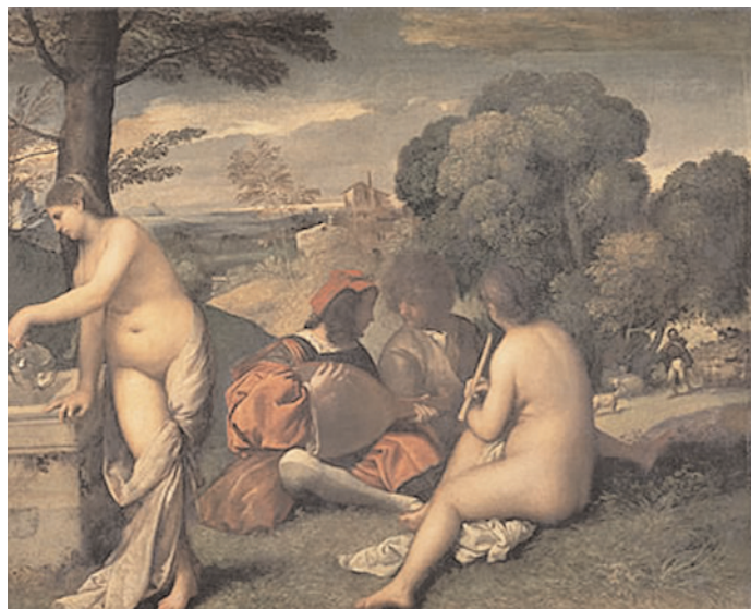
Concert Champêtre Tiziano, oil on canvas 1510