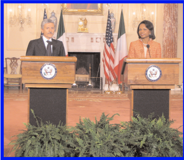
Massimo D'Alema and Condoleezza Rice at the Department of State during their joint press conference.

N ew Italian Deputy Prime Minister and Minister of Foreign Affairs, Massimo D'Alema paid his first visit to Washington DC upon Invitation by Secretary of State Condoleezza Rice.