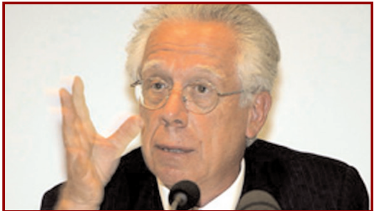
Tommaso Padoa-Schioppa, Italian Minister of Economy and Finance.

D uring his visit the Minister met Henry Paulson the Treasury Secretary, Ben Bernanke, Federal Reserve Chairman, Paul Wolfowitz President of the World Bank, and Rodrigo de Rato, Managing Director of the IMF.