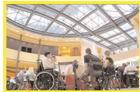
A view of the dinner