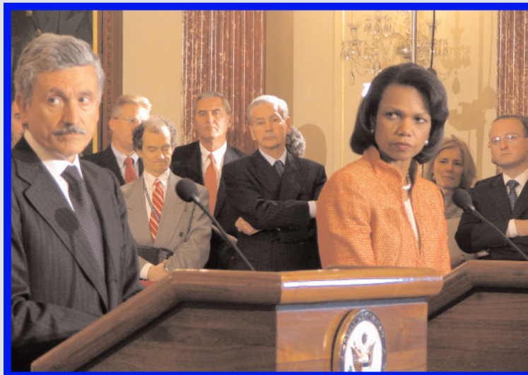
Massimo D'Alema and Condoleezza Rice during the press conference, I in the background Ambassadors Castellaneta and Spogli (U.S. Ambassadors to Italy).

N ew Italian Deputy Prime Minister and Minister of Foreign Affairs, Massimo D'Alema paid his first visit to Washington DC upon Invitation by Secretary of State Condoleezza Rice.