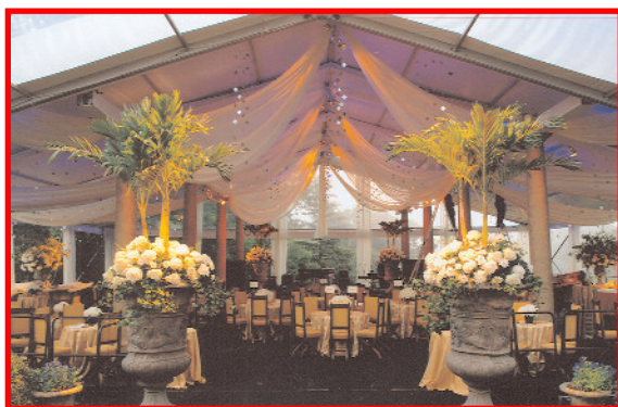
An enchanting decor set the mood