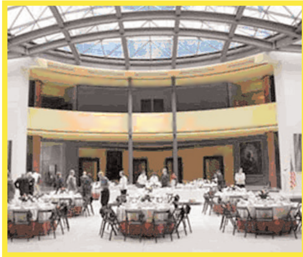
The Embassy of Italy in Washington, D.C., set up for the American Wounded Veterans Dinner on Friday, May 19, 2006