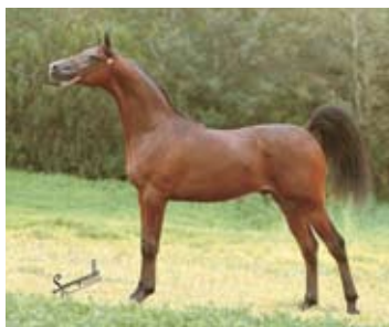
TOP Island Elegance’s sire, Couturier . MIDDLE ROW Island Mist with Ellie as a foal. BOTTOM Island Shamrock , full brother to Island Elegance.