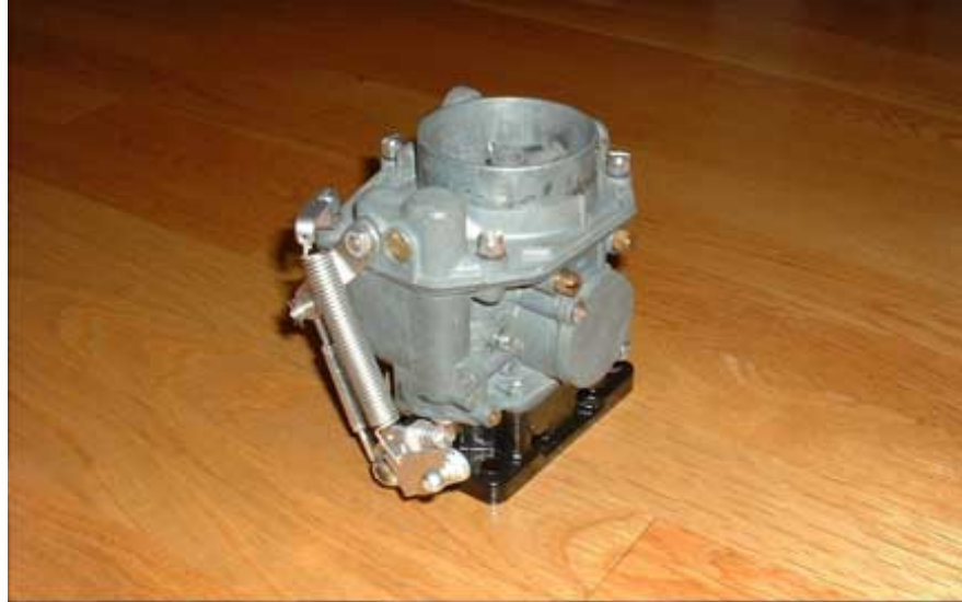
Zenith 32mm NDIX Carburetor