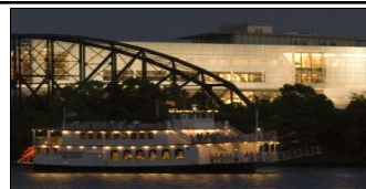
Clinton Presidential Library and the Arkansas Queen Riverboat