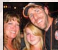
BZgal, Tigger & Apehanger