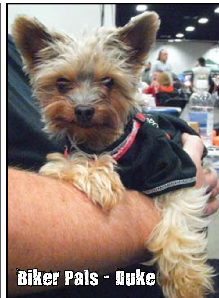
Biker Pals - Duke

Brand new Hi-Tec Camera for dad.....$1200 New Harley-Davidson Dress Shirt.....$65.00 Son using dad's new camera to take a picture of him riding in a cop car.... Priceless