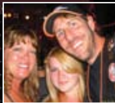
with BZgal, Tigger & Apehanger