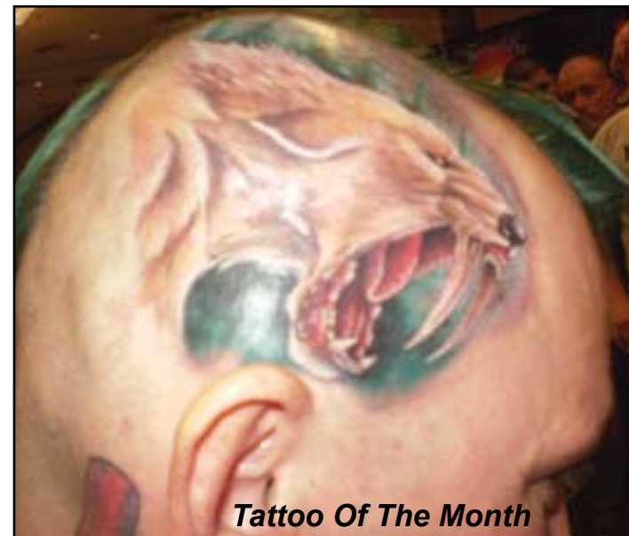
Tattoo Of The Month

Why did you just try singing the two songs above?