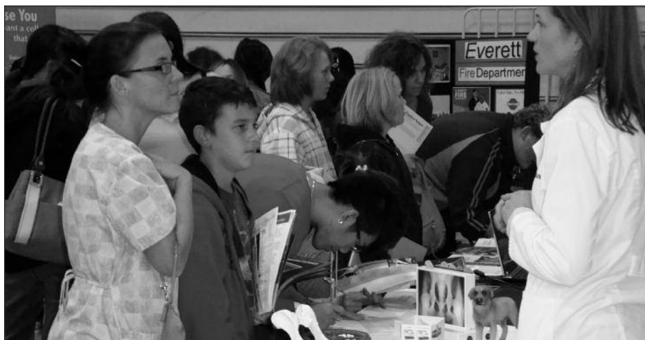
Parents and students visit with college and career representatives at the 2011 High School and Beyond event at Cascade High School.

Creating opportunities ~ Building futures